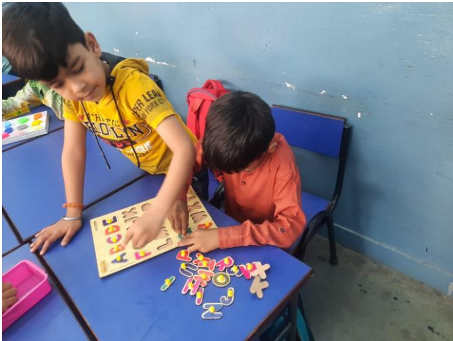
Learning by doing