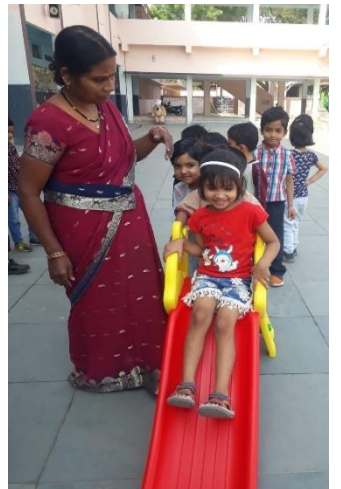
Welcoming the Balvatika Students