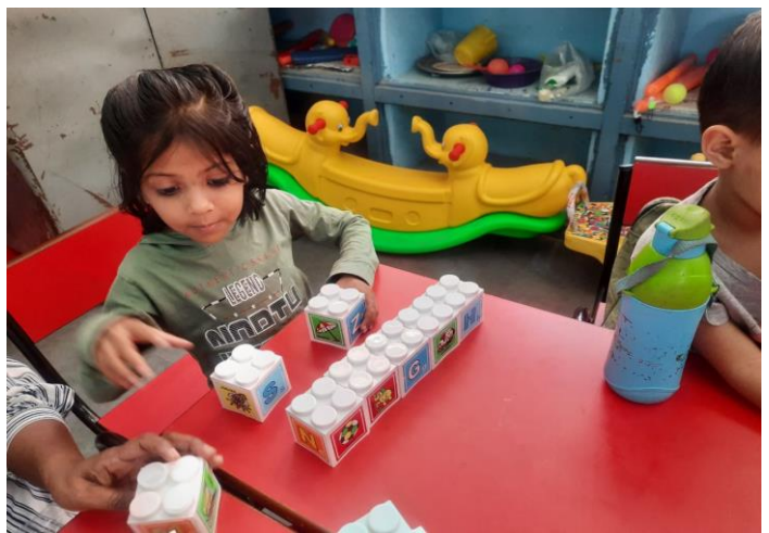
Play way method